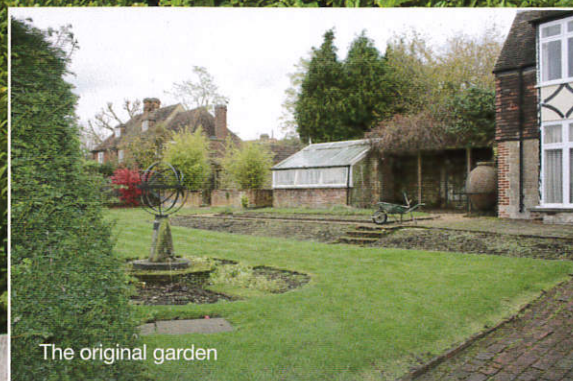
The original garden